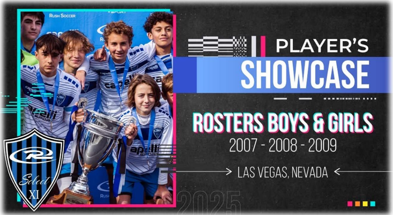
Above, Congratulations to our players who competed in the Players Showcase Las Vegas! Below, Rush Union Soccer continues to be a leader in Coaching Education!