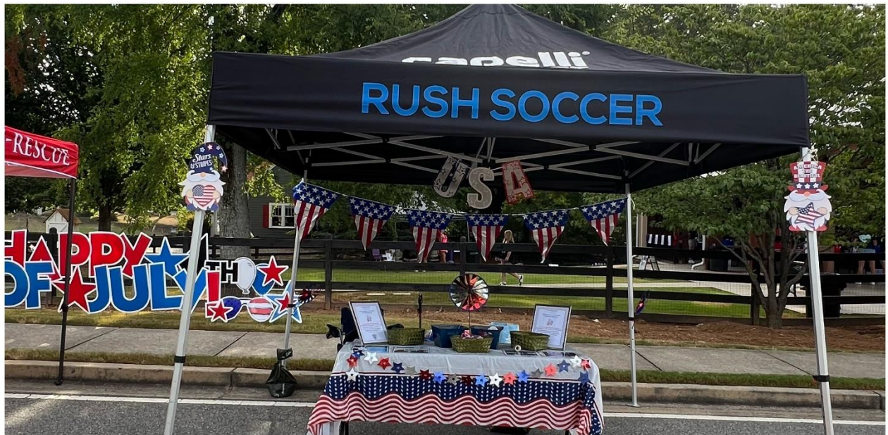
We had a lot of fun at the Milton July 4 th celebration!