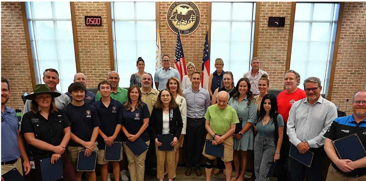
We were among other groups who were honored by the City of Milton this summer for outstanding contributions to the community.