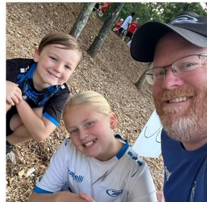
Rush Union players, coaches and families had a great time in the Dunwoody July 4 th Parade again this year!