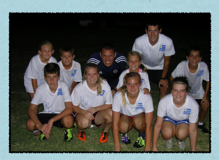
CONFIDENT? If confidence was measured in degrees Celsius Uruguay's confidence thermometer moved ahead of the temperature gage Wednesday. Brash? Daring? Dangerous?

midfielder Mikah was asked about being over confident, she auspiciously replied, "Over.. what?" It seems to permeate their play and if the team hoists the trophy then it will be that swagger that is given credit. But if they falter in elimination play, then "dangerous confidence" may stick.